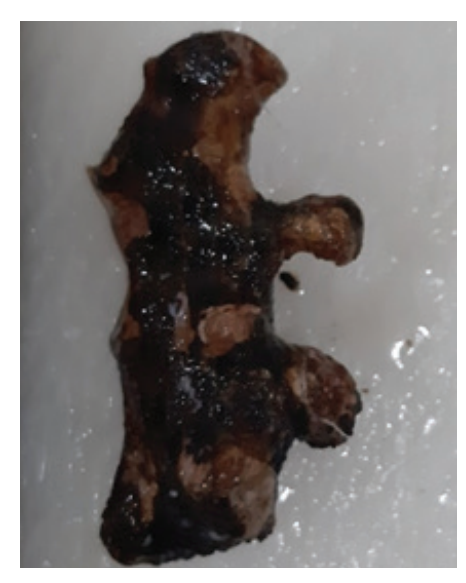
Figure 2: Staghorn Calculi was noted in the renal pelvis.