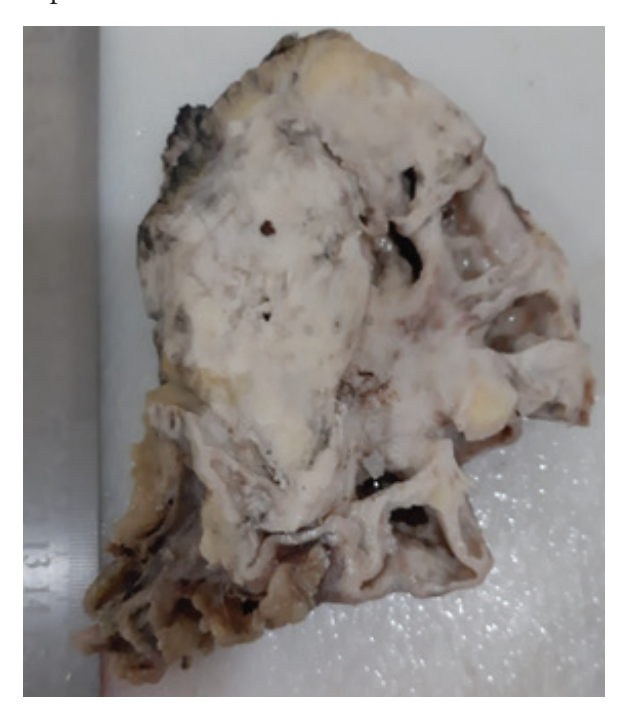
Figure 1 : Gross Specimen of Kidney Exhibiting Pelvicalyceal dilatation and infiltrating solid mass.

Squamous Cell Carcinoma, Well Differentiated type was seen along with renal pelvis dysplasia and tumor extending through the perinephric fat. Hydronephrotic changes were noted. Ureter and vessel margins were unremarkable. Lymphovascular and perineural invasion was not visualized. The tumor was staged- AJCC Stage III (pTNM: pT3aNoMo). The patient had an uneventful postoperative course.